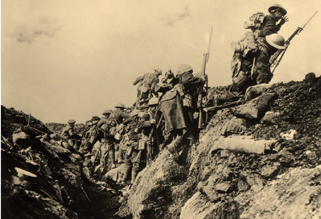
Canadian soldiers moving out of a trench onto a battlefield, c. 1916.

The last large-scale offensive of this period was at Passchendaele (the Third Battle of Ypres), lasting from July to November 1917. Some 200,000 to 400,000 casualties were suffered on each side, with men and horses drowning in the deep October mud churned up by weeks of relentless shelling. The name of this Belgian village, forever synonymous with mud, blood and horror, is among the most common battle names that appear on our memorials.