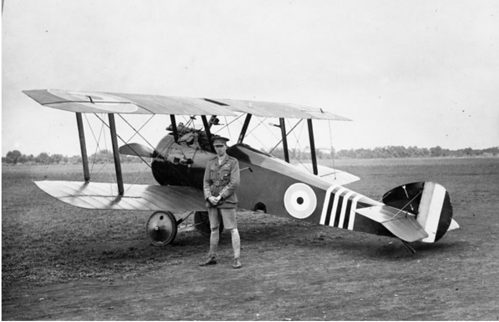
Dauphin-born Ace Billy Barker with his Sopwith Camel

On the ground, neither side proved able to deliver a decisive blow for the first two years of the war; battles were fought and many died as a few metres of muddy territory changed hands. Despite this general stalemate, these years were marked by bloody battles whose names many Canadians will recognize.