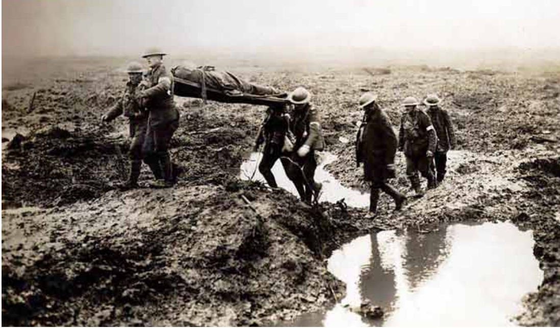
Canadian soldiers carrying a casualty through a bomb-cratered battlefield.

In early August, at the Battle of Amiens, the Allies began a counteroffensive known as the Hundred Days Offensive. Immediate and decisive Allied gains caused the German high command to realize that they could not now win the war. By late September, the first capitulation came when Bulgaria signed an armistice. Further Allied victories culminated at last in the German surrender in November 1918.